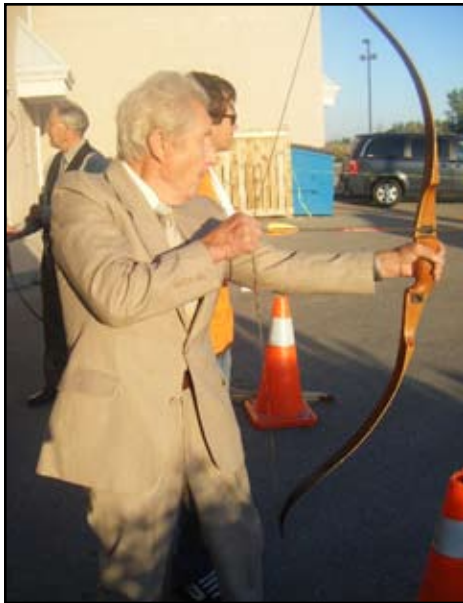
This year's banquet also included many activities for the young at heart.