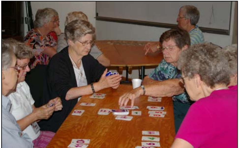
Rain kept activities inside but many games were played and friendships strengthened.